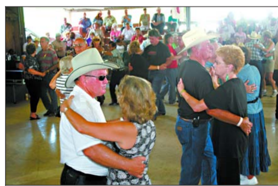
Couples take to the floor in the Fais Do Do pavilion at the Medina Lake Cajun Festival

I am spectacularly alone. I revel in the moment, then grab my cell phone and call my wife. I have to share this with someone.