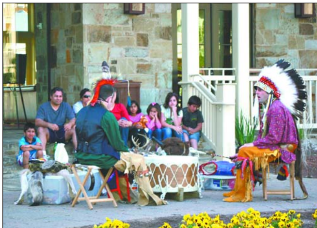
American Indian drumming is among the regular activities at the Hyatt Lost Pines that honor the area's history and traditions.

Both the Hyatt Lost Pines and the Four Seasons Austin also do a special Mother's Day brunch. These are held in their ballrooms like a party, and reservations are recommended.